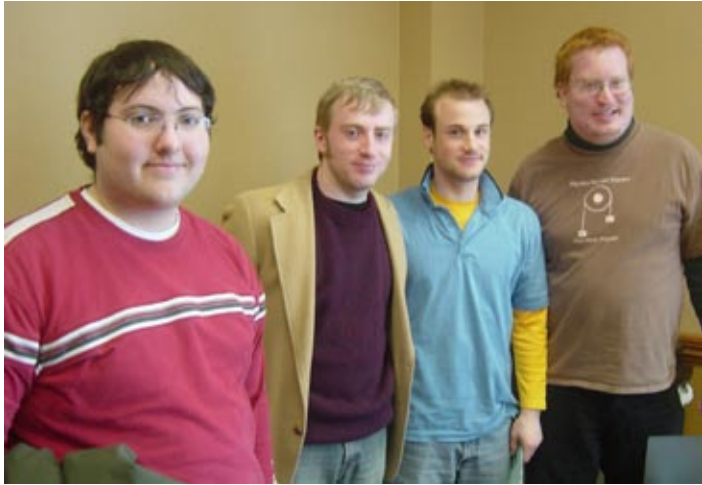
The Ohio State University College Bowl Team